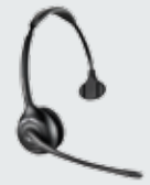
CS510 Over-the-head (monaural)

Plantronics legendary CS family is setting a wireless standard for desk phone communication with the CS500 Series. The system features the lightest DECT headset on the market, a streamlined design and professional performance all with the same reliability for hands-free productivity that has made the CS family a bestseller for over a decade.