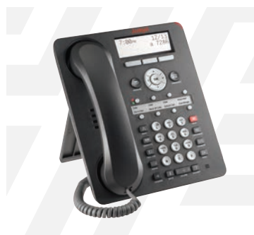
1408 Digital Deskphone