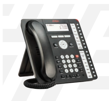
1416 Digital Deskphone