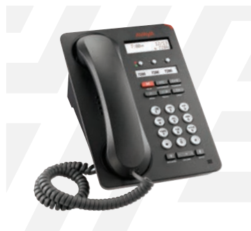
1403 Digital Deskphone (For IP Office only)